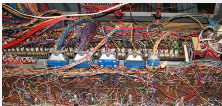
You can still make your control panels with lots of wires and switches..... Or you can move to a wide range of on-screen control options (A Big Bear software screen is shown)

Most importantly, you have CHOICE - Something that isn't easy to achieve when you run with DC control!