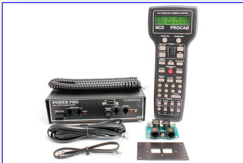
Click the picture to review NCE systems on DCCconcepts website

For the ability to add and use this new item alone, you really should include NCE in your short list!