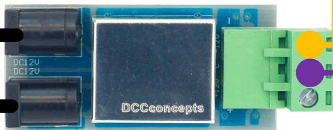
12v DC Split Power Supply DCP-SPS12